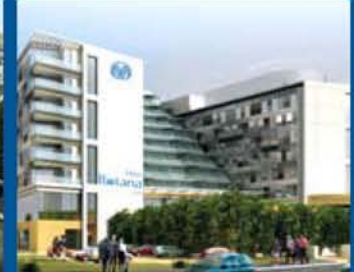
Oryx Rotana - 5 Star Luxury Hotel (MEP)