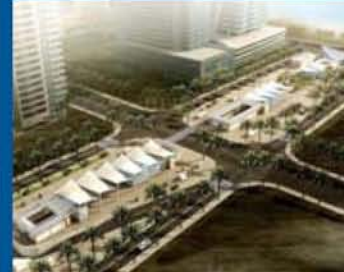
Lusail Underground Car Park (Mechanical)