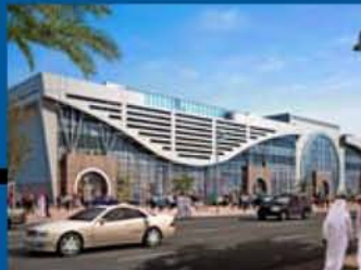
Barwa Commercial Avenue-BT2 (Electrical)