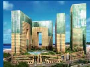
Al Dafna Towers (HVAC)