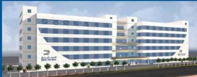
Qatar Petroleum Nakilat Head Quarters Building at Ras Laffan (MEP)