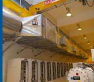
Kahramaa Substations (MEP)