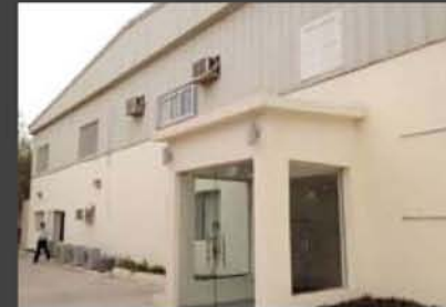
Salwa Industrial Area Office