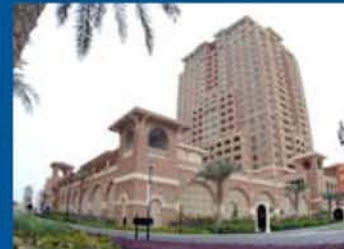
Pearl Qatar: Porto Arabia Parcel 1C (MEP)