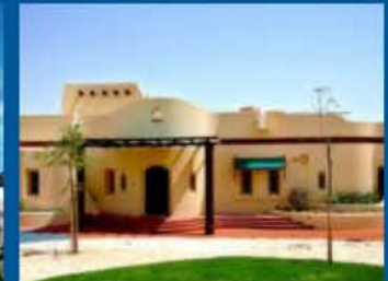
Private Luxury Villas (Mechanical)