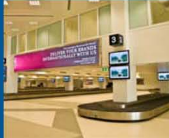
Doha International Airport - New Arrival Terminal (Main Contractor)