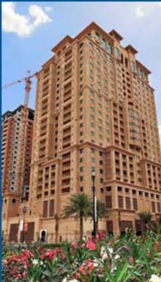
Pearl Qatar: Porto Arabia Parcel 2A (MEP)