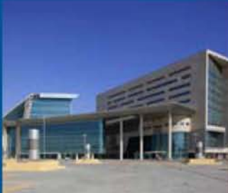
Hamad Medical City (Mechanical)