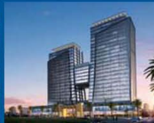
Shemoukh Twin Towers (Mechanical)