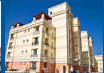
Pearl Qatar: Viva Bahriyah VB 29 (MEP)